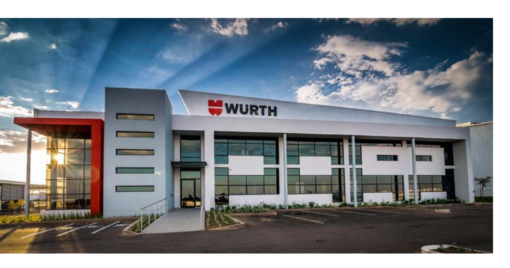
Wuerth South Africa (Pty.) Ltd. in Gauteng, South Africa

In particular, we must exercise caution when collecting and processing personal data. We comply with the applicable data privacy and protection laws and appoint appropriate offices and positions to be responsible for compliance.